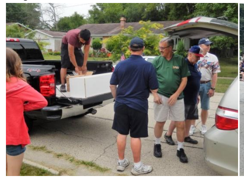
Pre-Parade, Preparing the Tootsie Rolls