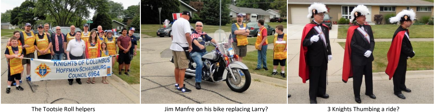
The Tootsie Roll helpers