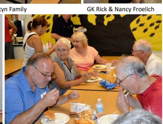
Time to Eat!