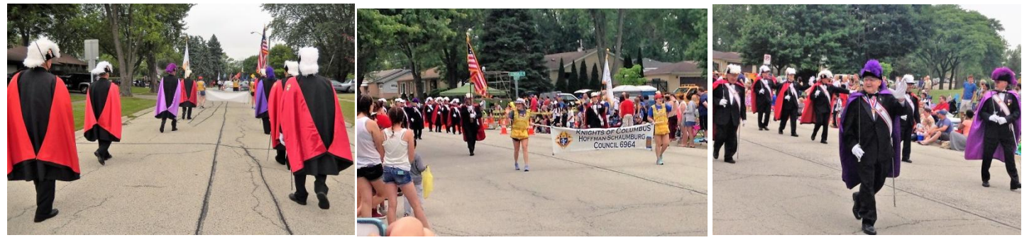
View from inside us marching